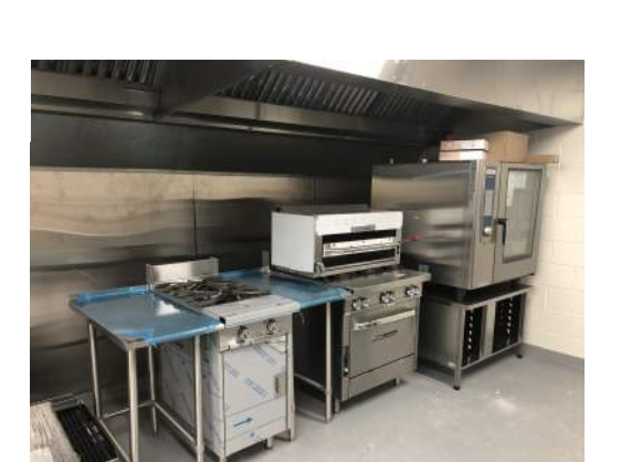
Installation of Kitchen Equipment at Culinary Arts Lab 136