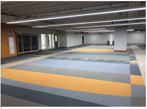
Installation of Carpet and Base on the Second Floor