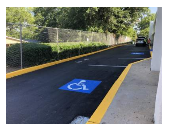
Asphalt Paving and Striping