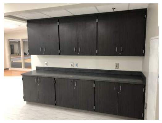
Installation of Casework and Countertops at Fire & Emergency Services 233